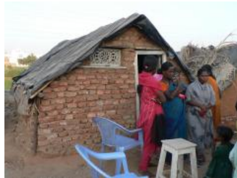
Church building in the slums